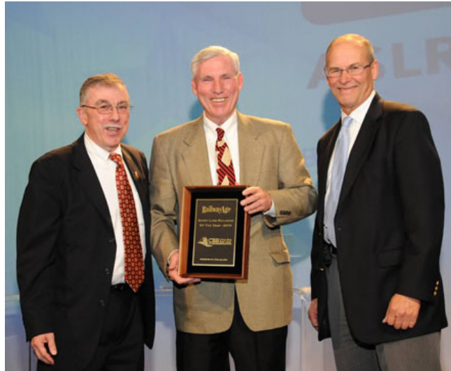
Coos Bay Rail Link received Railway Age's 2014 Short Line Railroad of the Year award at this year's ASLRRA convention in San Diego.